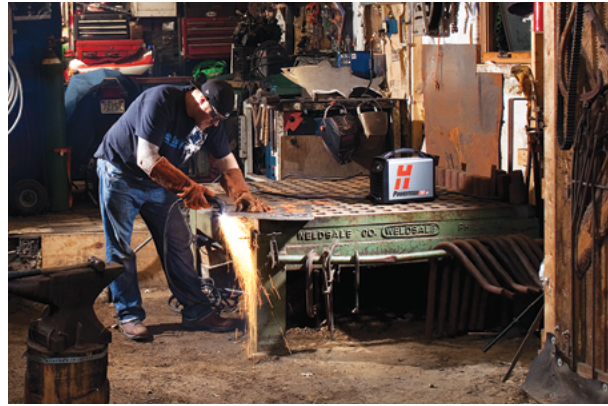
Home hobby and metal art

HVAC, agricultural, property/plant maintenance, fire and rescue, general fabrication, plus: