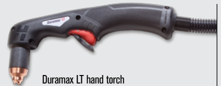
Duramax LT hand torch