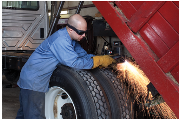
Vehicle repair and modification